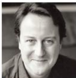
David Cameron Leader of the Conservative Party